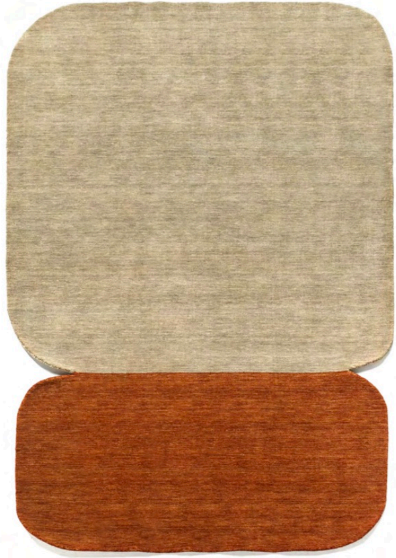
Naturaleza · Beige Orange