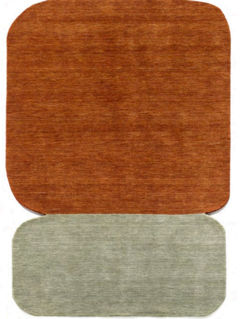
Naturaleza · Orange Green