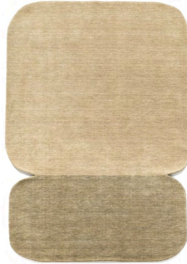
Naturaleza · Beige

Technique: Loom Knotted Composition: 100% Wool Height: 10 mm Sizes: 170 x 240 cm · 200 x 300 cm