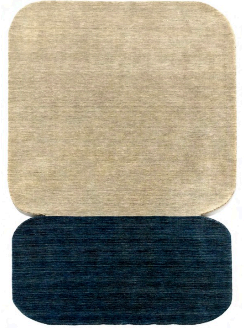
Naturaleza · Beige Blue