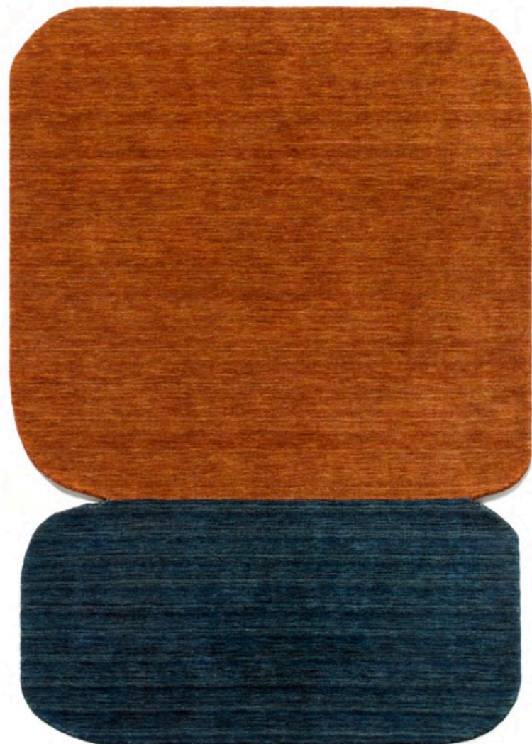
Naturaleza · Orange Blue

Technique: Loom Knotted Composition: 100% Wool Height: 10 mm Sizes: 170 x 240 cm · 200 x 300 cm