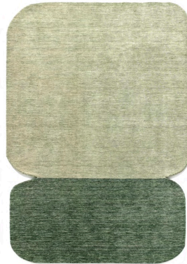
Naturaleza · Green