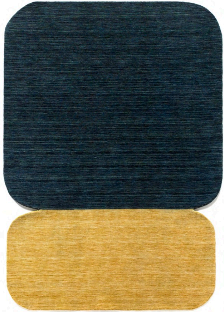
Naturaleza · Blue Yellow