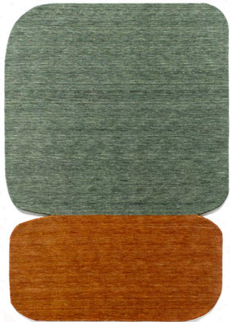
Naturaleza · Green Orange