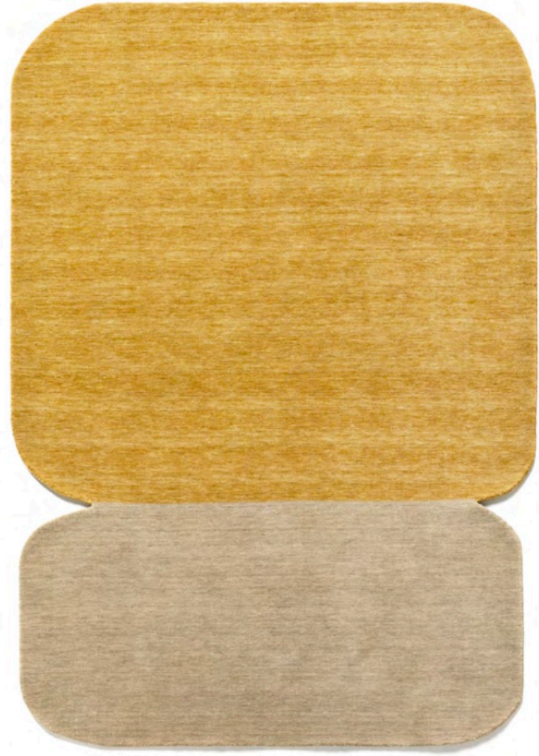
Naturaleza · Yellow Beige

Technique: Loom Knotted Composition: 100% Wool Height: 10 mm Sizes: 170 x 240 cm · 200 x 300 cm