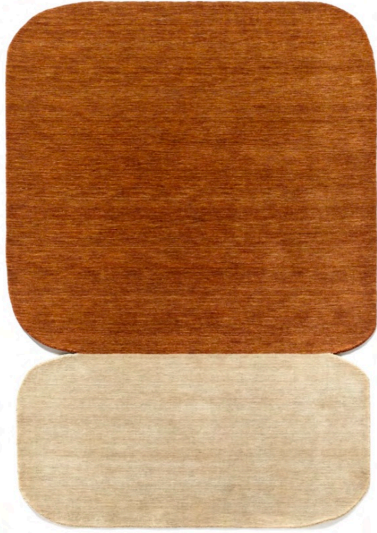
Naturaleza · Orange Beige

Technique: Loom Knotted Composition: 100% Wool Height: 10 mm Sizes: 170 x 240 cm · 200 x 300 cm