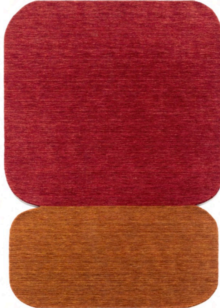
Naturaleza · Red Orange

Technique: Loom Knotted Composition: 100% Wool Height: 10 mm Sizes: 170 x 240 cm · 200 x 300 cm