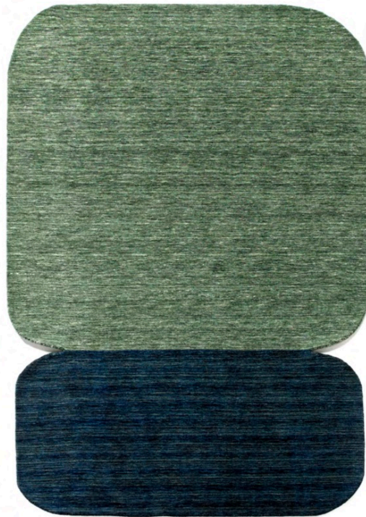
Naturaleza · Green Blue

Technique: Loom Knotted Composition: 100% Wool Height: 10 mm Sizes: 170 x 240 cm · 200 x 300 cm